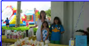
Paint Your Pottery